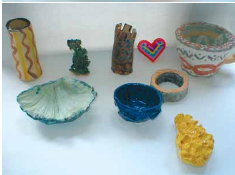
CERAMICS PRODUCED ON A CREDO COURSE