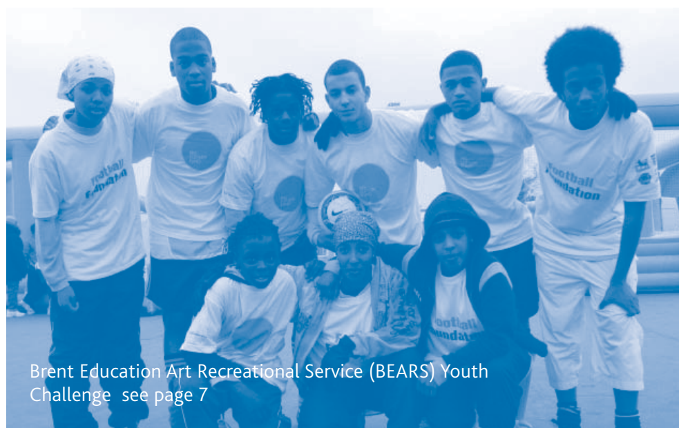
Brent Education Art Recreational Service (BEARS) Youth Challenge see page 7

21 June 2006, 9.30am to 1.00pm @ Stockwell Resource Centre